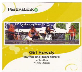
GIRL HOWDY "Festivalink.net: Rhythm and Roots Festival 2006" Live concert set from the main stage