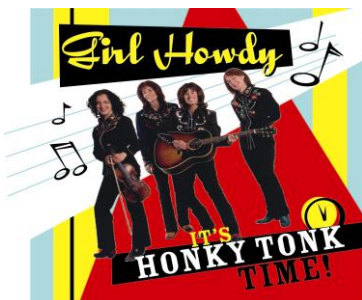
GIRL HOWDY "IT'S HONKY TONK TIME!" (2006) 6-song EP featuring Honkytonk classics

CONTACT – Girl Howdy/190 North St/Northampton, MA 01060/413.695.2141 WEB: www.girlhowdyband.com E-MAIL: ghowdymusic@yahoo.com